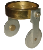
Torch bracket for circular & linear cut